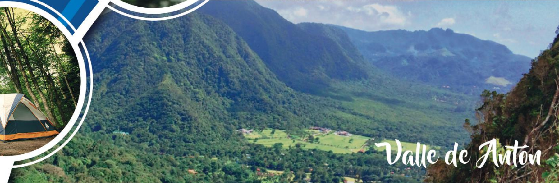
Valle de Antón