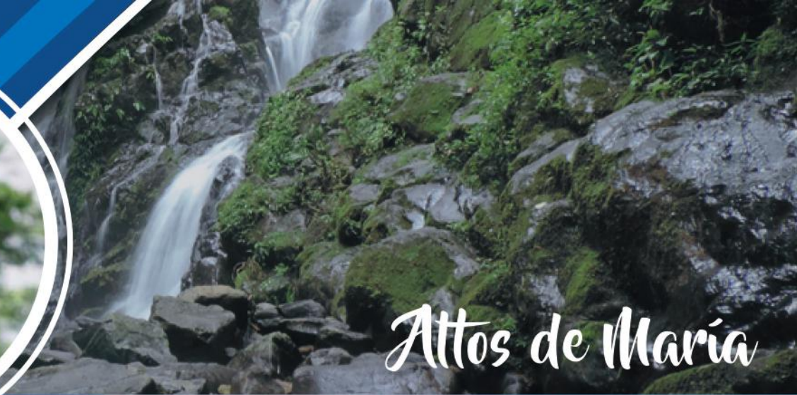
Altos de María